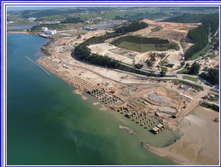
New quay for port of Aviles along the right bank, Spain (Piles)