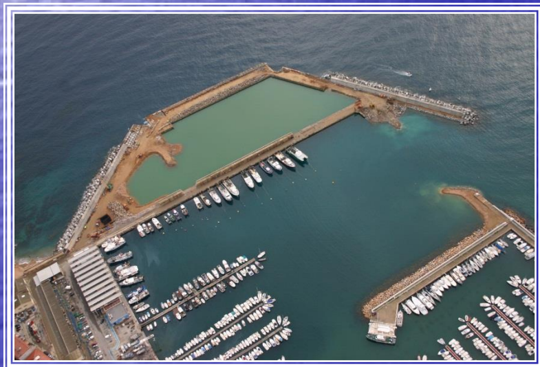
New breakwater for the Port of Blanes (Gerona), Spain (Concrete caissons and rubble mound breakwater)