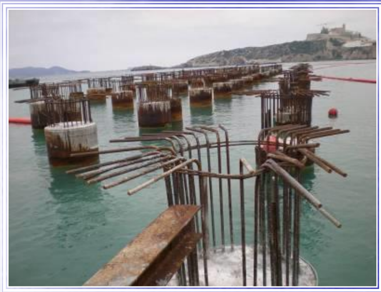
Cruise docks for the Port of Ibiza (Balearic Islands), Spain (Piles & Caissons)

INCREA is a Spanish engineering Company specialized in civil engineering projects and consulting.